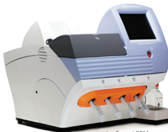
Ion Torrent PGM